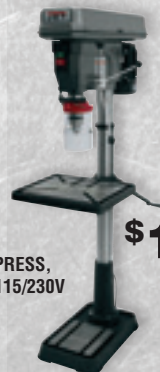
354170 JDP-20MF, 20" FLOOR DRILL PRESS, 1-1/2 HP, 1PH 115/230V