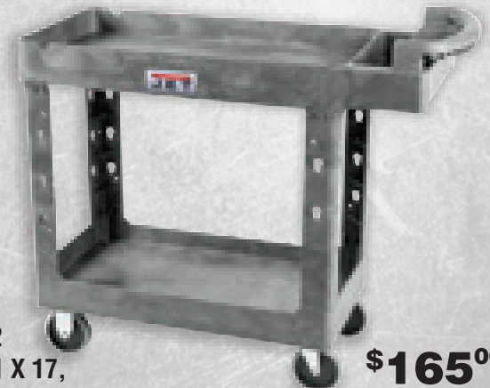
141012 PUC-41 X 17, RESIN UTILITY CART