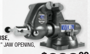
28840 TRADESMAN 1745XC VISE, 4-1/2" JAW WIDTH, 3-1/2" JAW OPENING, 3-1/4" THROAT DEPTH