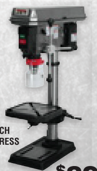
354401 J-2530, 15" BENCH MODEL DRILL PRESS 115V 1PH