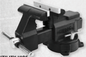
50005 CLASSIC UTILITY VISE, 5-1/2" UTILITY VISE, 3-1/4" THROAT