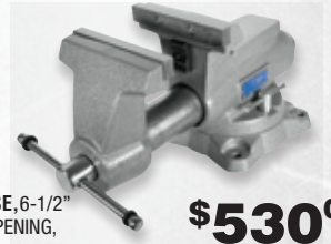
28812 MECHANICS PRO VISE, 6-1/2" JAW WIDTH, 6" JAW OPENING, 360° SWIVEL BASE