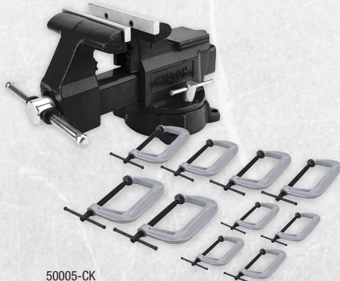
50005-CK COMBO SET 10-PIECE C-CLAMP KIT, 5-1/2" UTILITY VISE, 3-1/4" THROAT