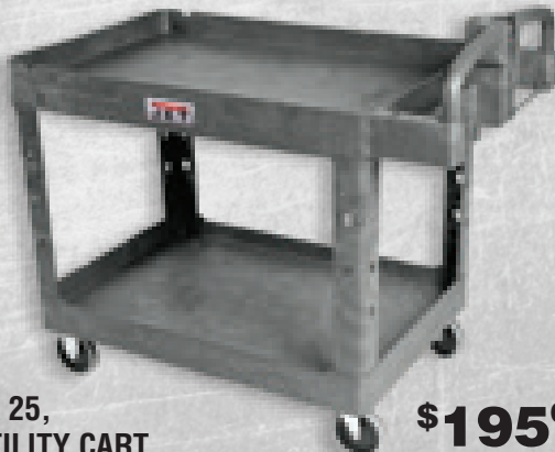
141016 PUC-43 X 25, RESIN UTILITY CART