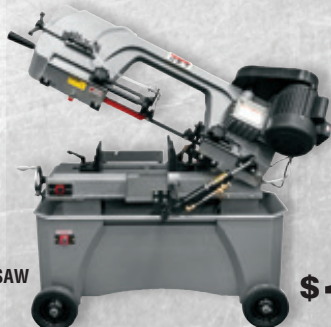
414559 HVBS-712, 7" X 12" HORIZONTAL / VERTICAL BANDSAW