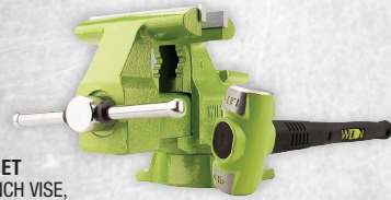
11128BH COMBO SET 6-1/2" BENCH VISE, 4 LB. SLEDGE HAMMER