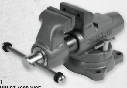
28831 MACHINIST 400S VISE, 4" JAW, 3-1/2" THROAT, 6-1/2" MAX OPENING