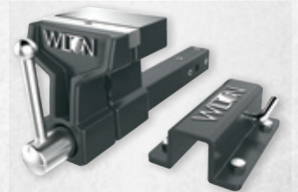
10010 6" ATV ALL-TERRAIN™ VISE