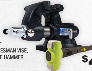
28806A COMBO SET 5-1/2" TRADESMAN VISE, 4 LB. SLEDGE HAMMER