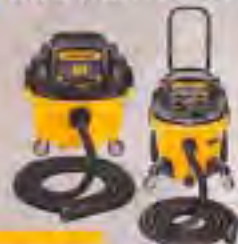
TABLE 1 COMPLIANT SILICA DUST CONTROL TOOLS IN STOCK. TABLE 1 COMPLIANT OR NOTHING AT ALL.